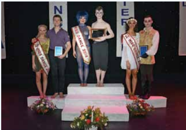
Miss Dance and Dance Master Winners and Runners-Up