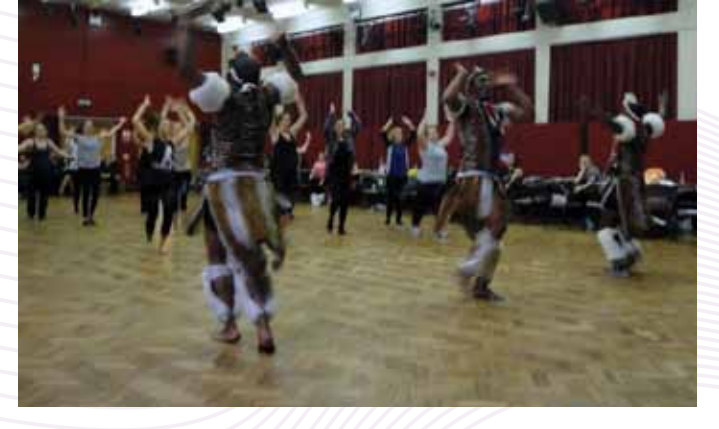
Zulu Nation in action