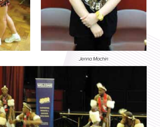
Zulu Nation in action