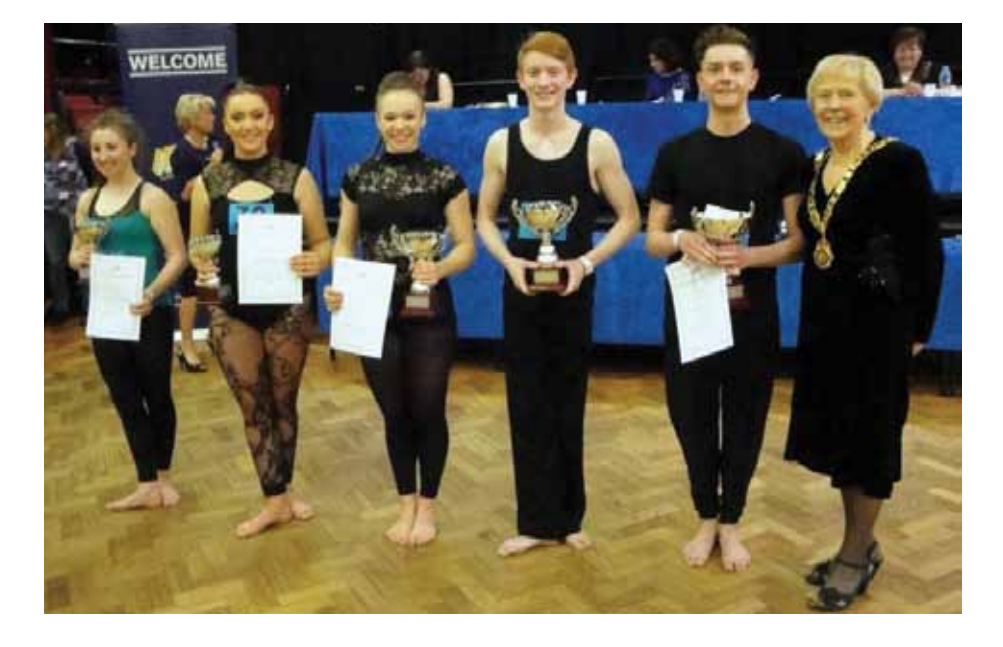
Over 16 Finalists