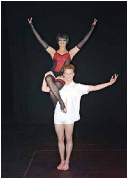
Miss Dance of Great Britain 2015 with Dance Master UK 2015