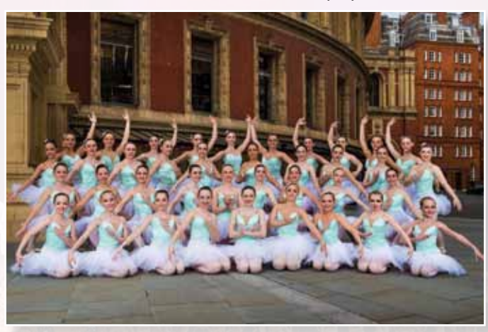
LWHS Arts Garage - Le Danse Classique