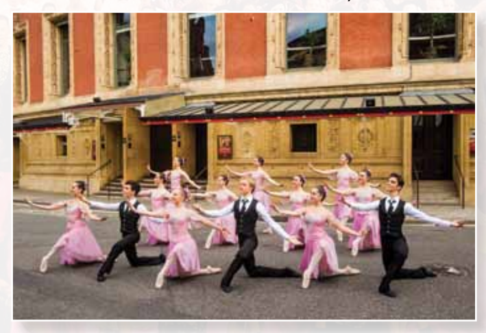
IL Balletto - Voci Di Primavera