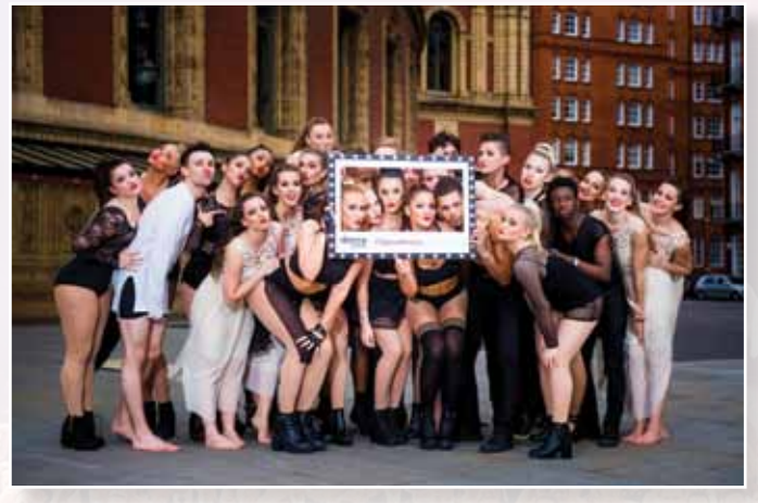
MADD College - Joie De Vie