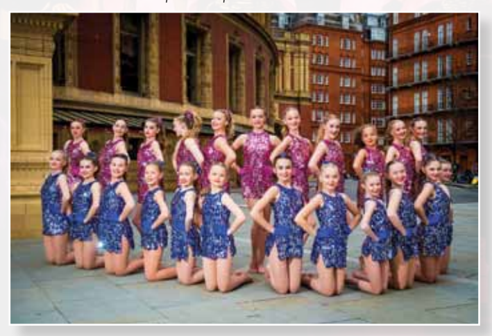
Expressions Theatre Arts - Celebrating Motown