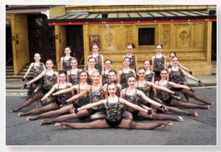
Summerscales Performing Arts - Thunder