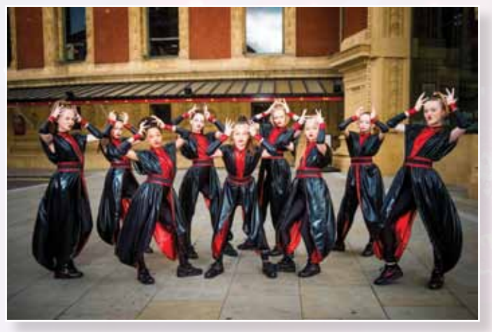
Sugarfree, Goodman Dance - Juicy