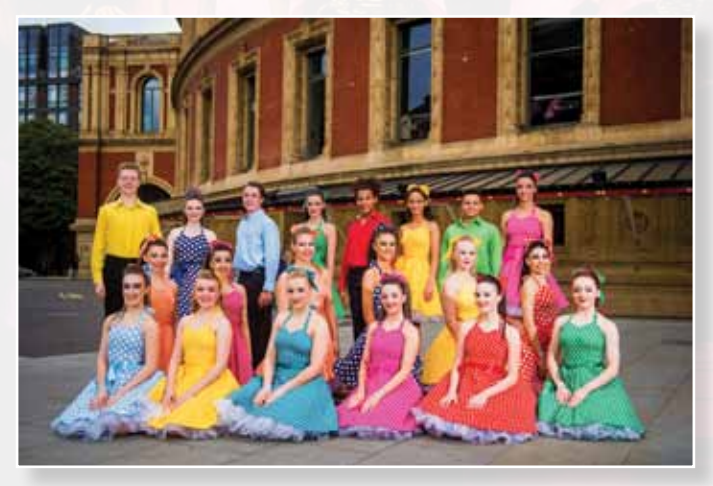
Dupont Dance - Soda Pop