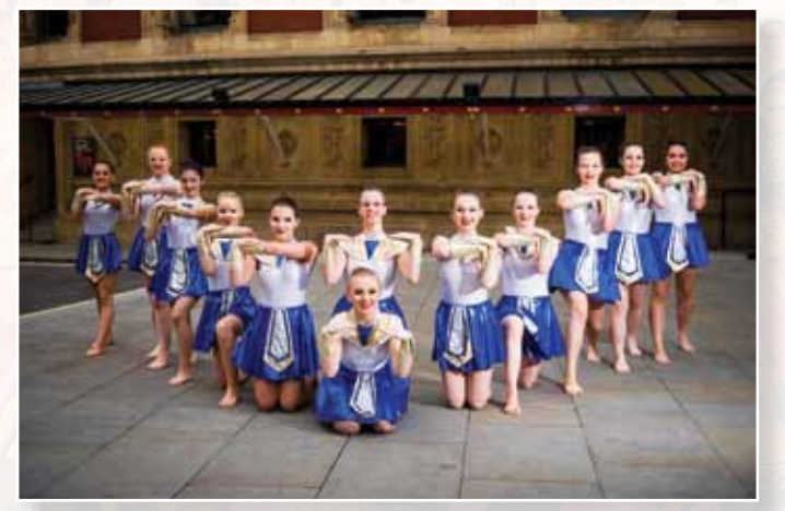
A2 Arts Performing Arts Academy - Egyptian