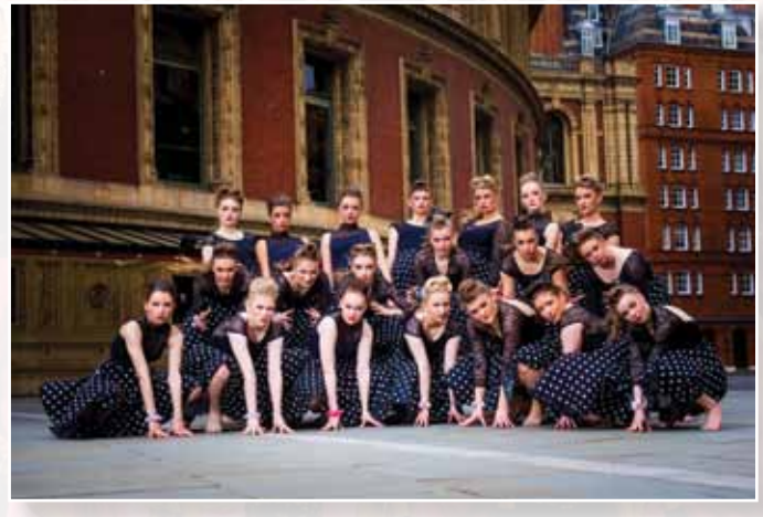
Kulturskolen, Tromso Kommune - Sweet Sixteen Issue