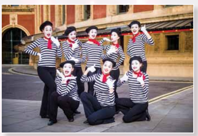
Elsber School - The Mime