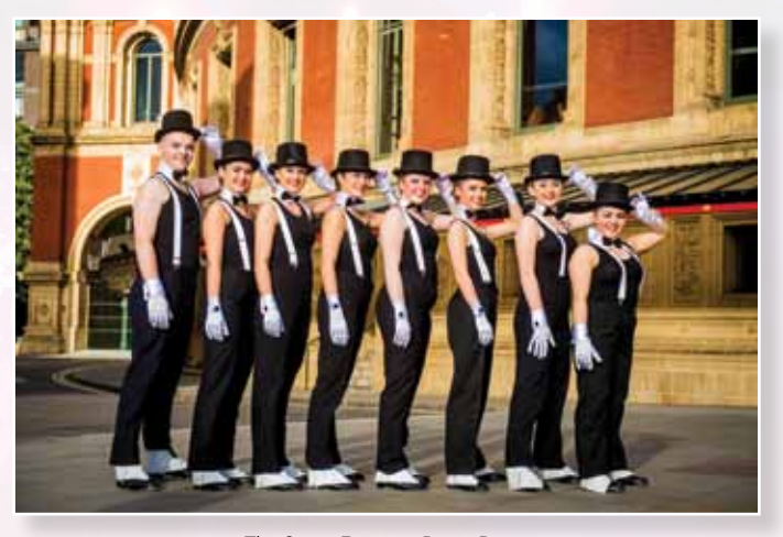
The Stage Factory - Bang Bang