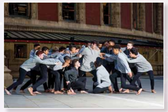
Khronos, Brit School - Over The Edge