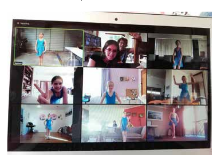
Students from Alison's Studio of Dance (New Plymouth) taking online classes during lockdown

Along with large parts of the world, New Zealand was suddenly forced into lockdown (or Alert Level 4, as we all referred to it as) by our Government to combat the COVID-19 virus. For us this occurred on 26 March – we were only given 48 hours' notice to get ourselves prepared. We had one of the strictest lockdowns in the world. The only services allowed to operate were Supermarkets, Dairies, Chemists, Petrol Stations and Medical Centres/Hospitals.