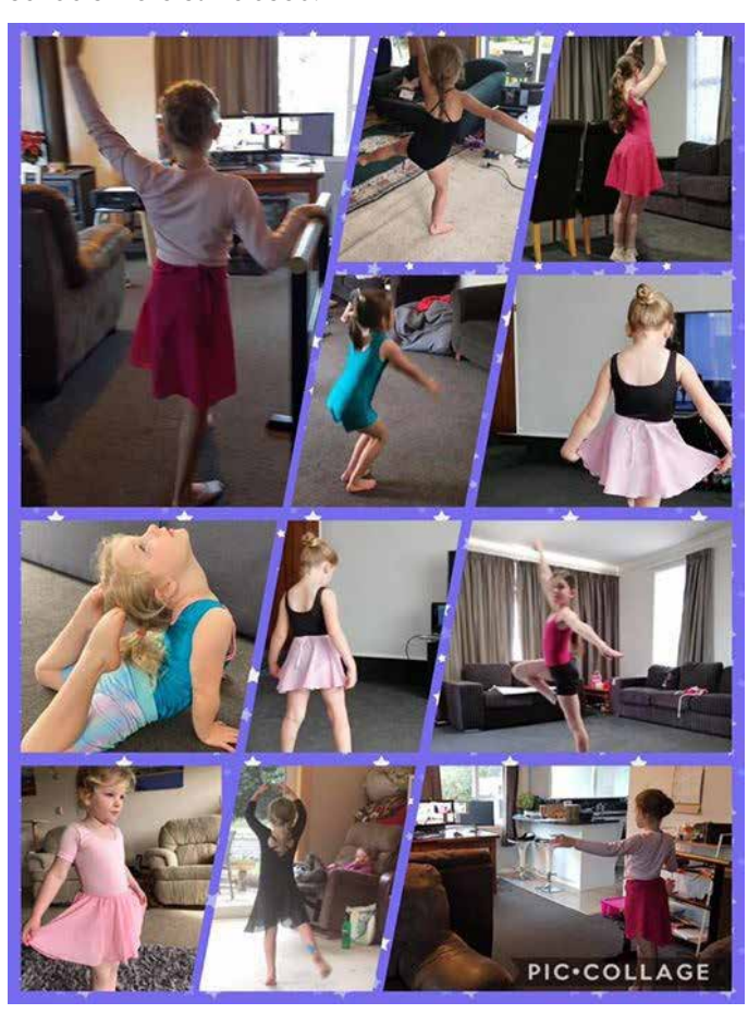
Students from the The Rose Academy (Pahiatua & Palmerston North) dancing at home during lockdown

We were extremely lucky here in New Zealand that due to several factors (going into lockdown early and quickly, great leadership from our Prime Minister, being an island nation and our small population largely doing as requested) our initial lockdown was eased after 5 weeks and on 28 April some services were able to reopen as the Government moved us into Level 3 of their Pandemic Control plan. We could go and get a McDonald's Hamburger or a takeaway coffee. Unfortunately dance schools were still closed.